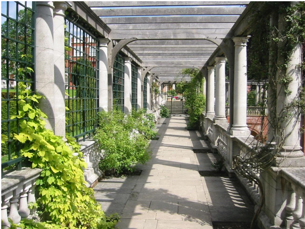
Photograph 1: Pergola today