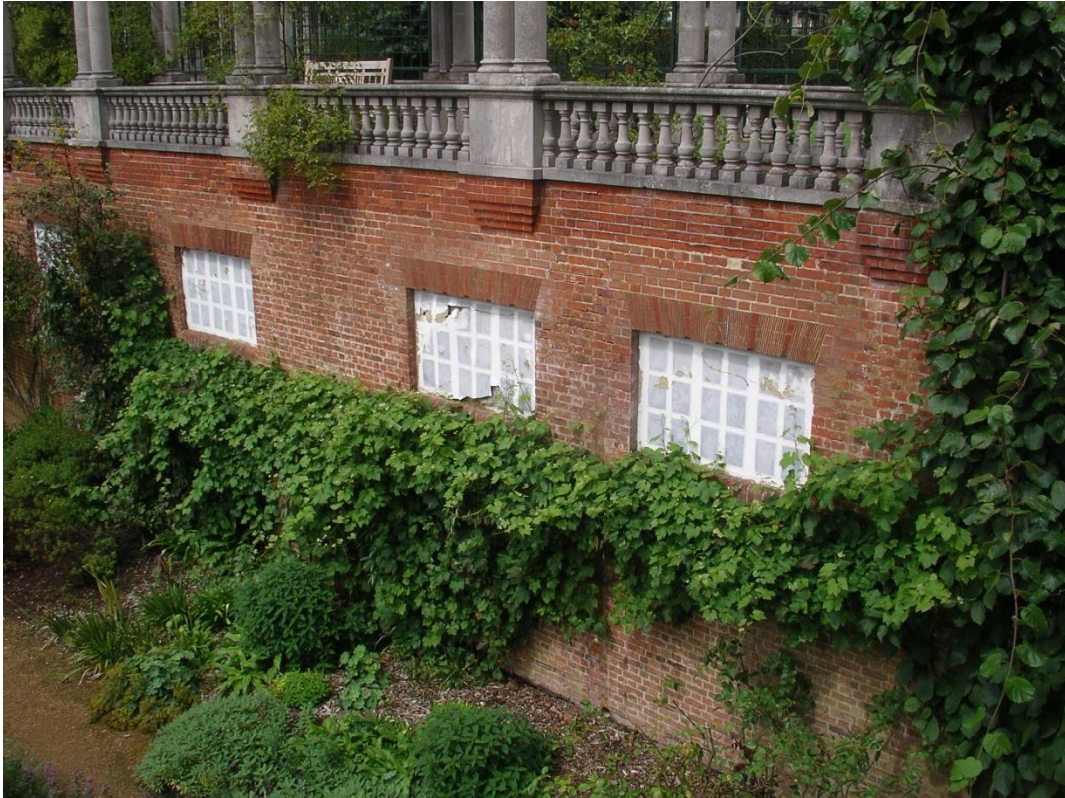
Photograph 3: Re-rendered false windows after works