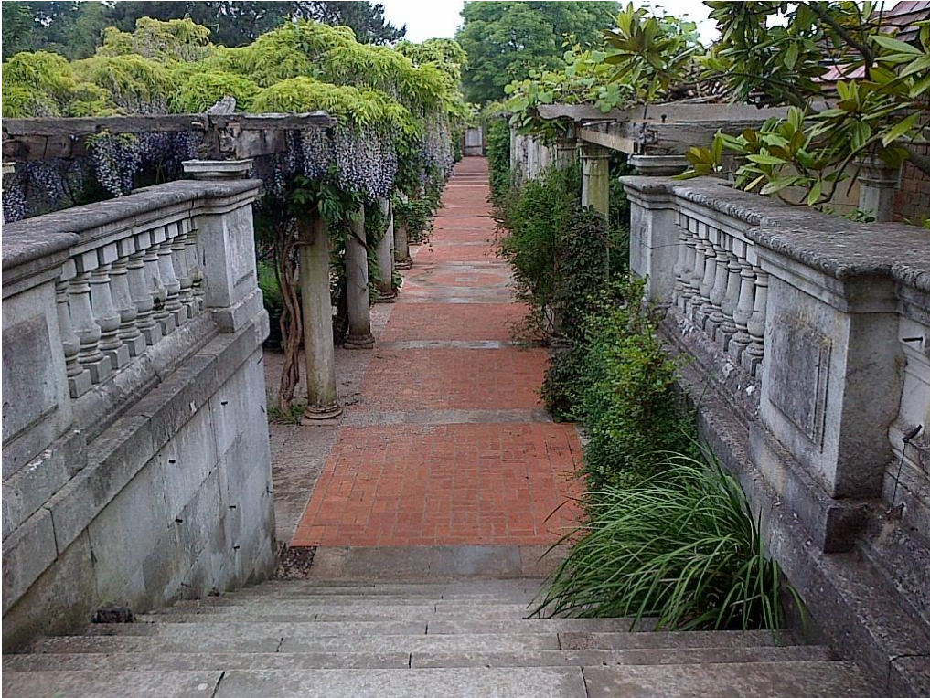
Photograph 6: Boundary wall repairs